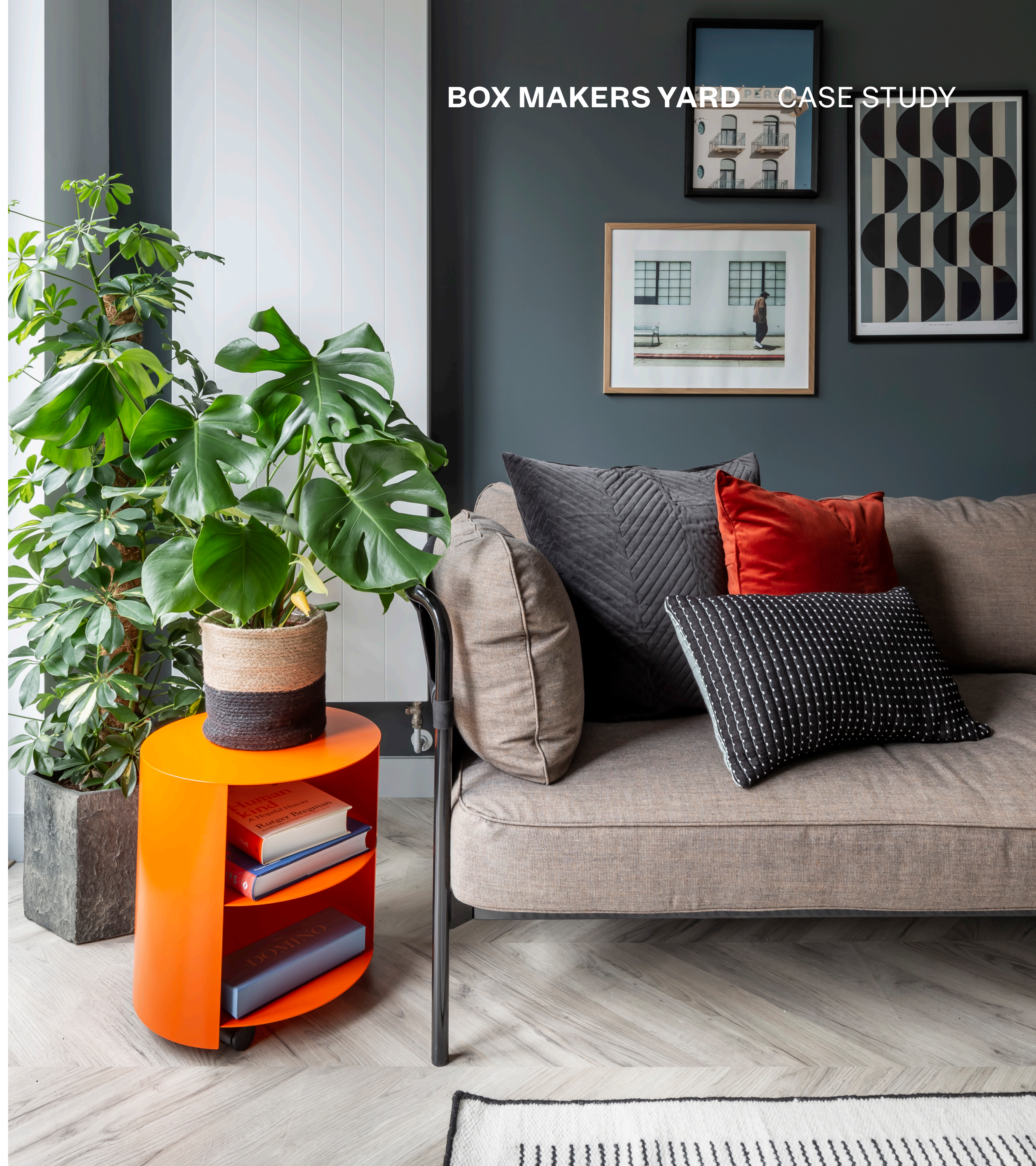
BOX MAKERS YARD CASE STUDY